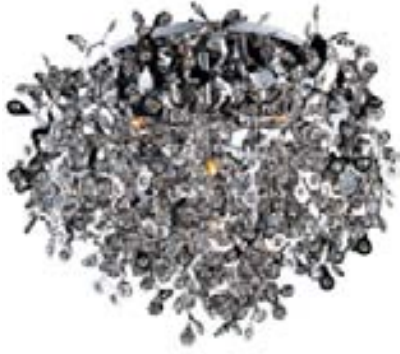
24200BCPC Comet 7-Light Flush Mount