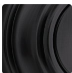
Matte Black 514