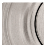
Satin Nickel 15