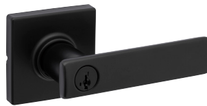
Breton Lever with Smartkey Security contemporary square rose in Matte Black