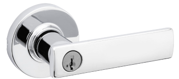
Breton Lever with SmartKey Security round rose in Polished Chrome